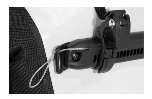
Anti-theft device mounted inside QL2.1 rail