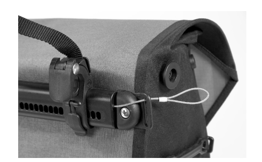
Anti-theft device mounted to QL2 pannier