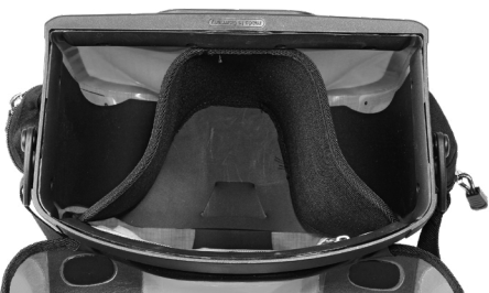
Ultimate Six Internal Divider (not included)