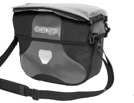
Mounting of optional accessory Ulti-mate Six Map-Case (not included)