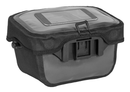
5 L version: smartphone in transpa-rent lid compartment (not included)