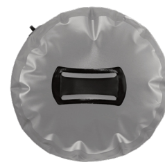
Baseloop for holding and easy emptying