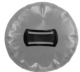
Base loop for holding and easy emptying