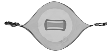
Inside of dry-bag