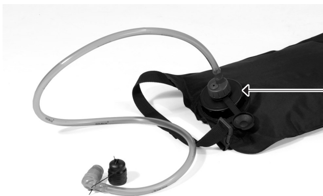
Application example: drinking tube with ORTLIEB waterbag