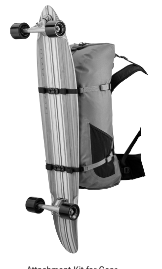
Attachment Kit for Gear (Attachment for skateboard)