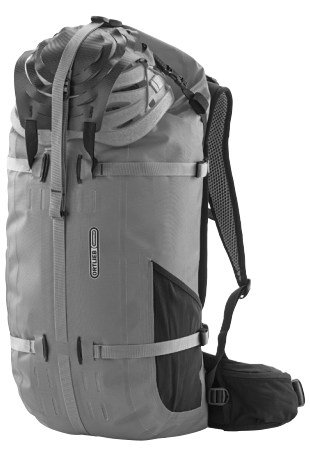
Attachment Kit for Helmets (Universal mounting for various helmets and gear)