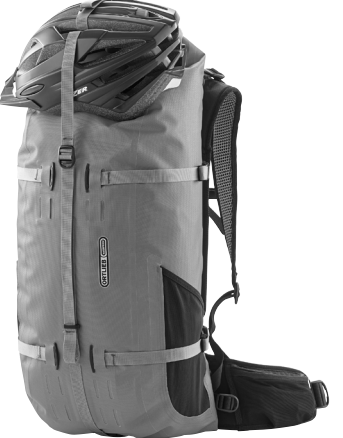
Attachment Kit for Helmets (Helmet toggle for fixing helmets with larger ventilation slots)