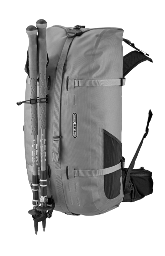
Attachment Kit for Gear (Mounting trekking poles)