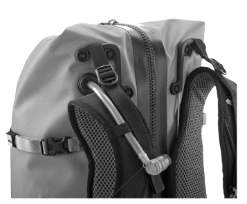
Atrack Hydration System (Waterproof hydration tube port)