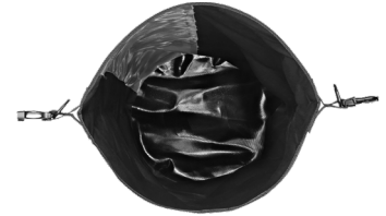
Inside of dry-bag