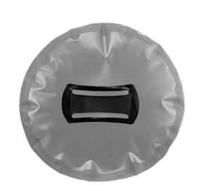
Base loop for holding and easy emptying