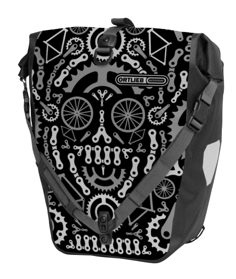
Design "Dia de la Rueda"

Rear pannier (single pannier) with roll closure and QL2.1 system