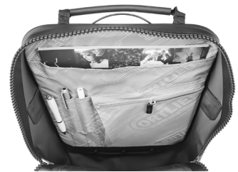
Inner pocket with organizer