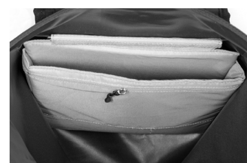
Inner pocket for laptops