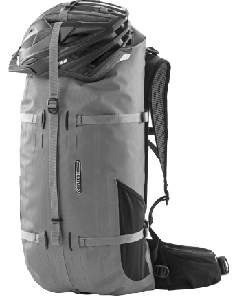
Attachment Kit for Helmets (Helmet toggle for fixing helmets with larger ventilation slots)