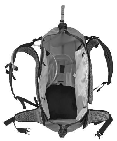
Atrack Hydration System (Attachment for hydration system)