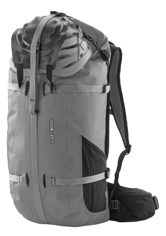
Attachment Kit for Helmets (Universal mounting for various helmets and gear)