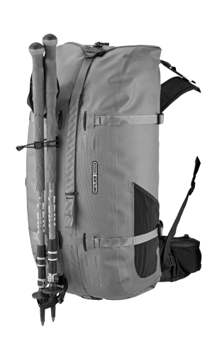
Attachment Kit for Gear (Mounting trekking poles)