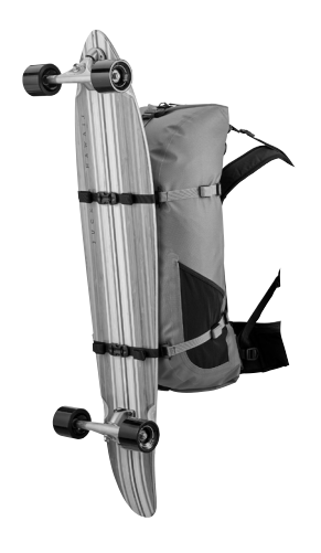
Attachment Kit for Gear (Attachment for skateboard)