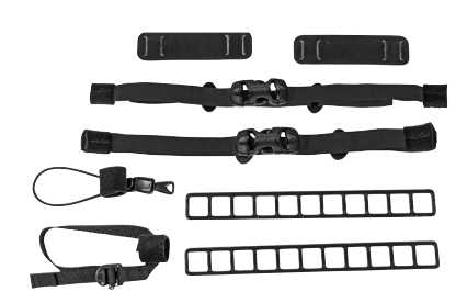
Attachment Kit for Gear (for trekking poles, snowboard, skis)