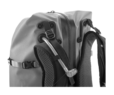
Atrack Hydration System (Waterproof hydration tube port)