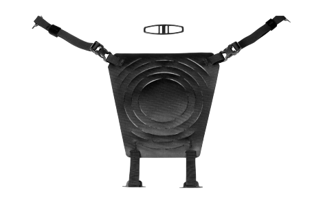
Attachment Kit for Helmets