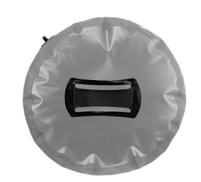
Base loop for holding and easy emptying