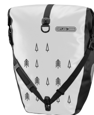
Design „Trees“ in white-black (PD620/PS490)