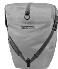
Design „PS33“ in pistachio (PS33)