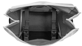
inner Compression Straps