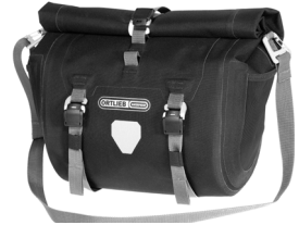
Handlebar-Pack Plus with carrying strap