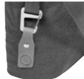
Detail: fixing of shoulder strap by means of snap hook