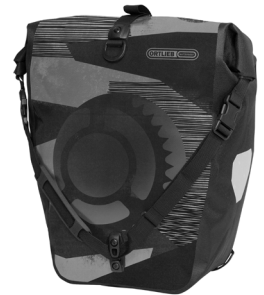
Design 1: Chaining