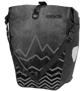
Design 2: Sierra