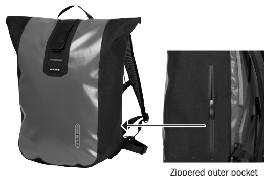
Zippered outer pocket